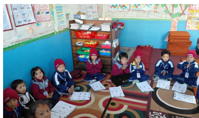
Children attending Thimi creche