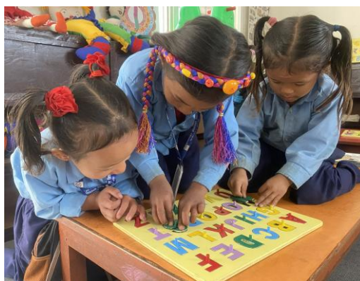
Students practicing with English language alphabet letters