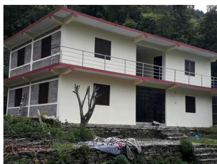
4 classroom block completed at Tawal secondary school, a hub school for Tawal and five nearby villages