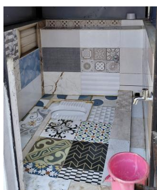
New toilet for the creche