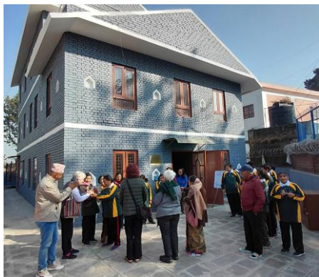
Sungava board members welcome to the rebuilt Sungava Home