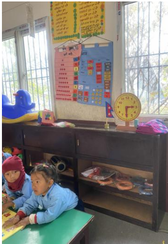
ECED kit box resources on display on shelves made by a parent