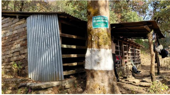
Forest shelter enroute to Pasang Chowk constructed 10 yrs ago with NAFA funding