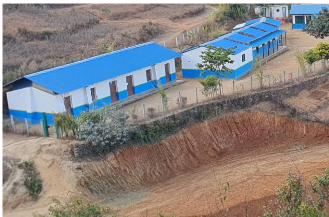
Happy students attending Sapana community school