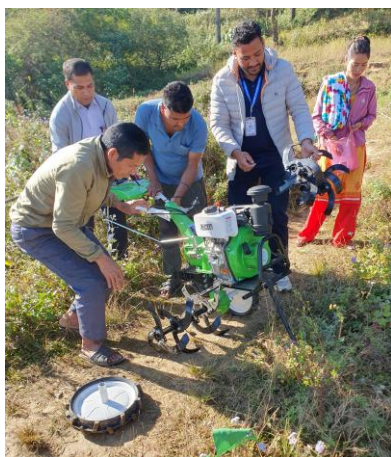
Mini-tractor set up for use in the Women's Empowerment Group farm