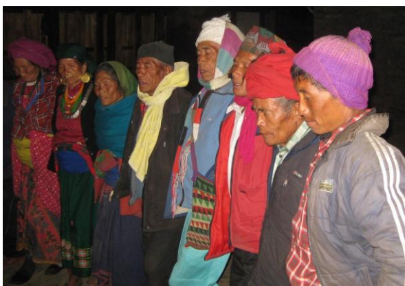
Tawal elders dance the Mane Dori at night