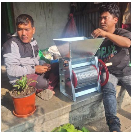
Locally roasted coffee