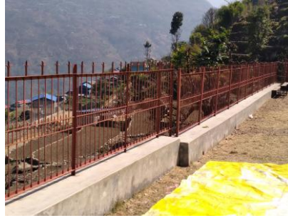
Compound wall and railing provides safety at Richet Primary School