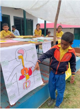
Open day at Sapana Community School