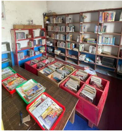
Gamauli School library