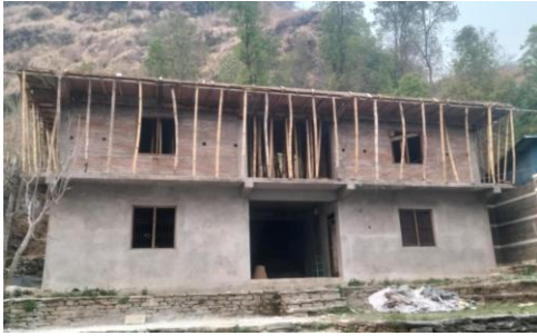
Four-classroom block at Tawal Secondary school nears completion