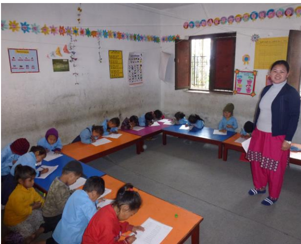
Nursery students writing exams in Tawal