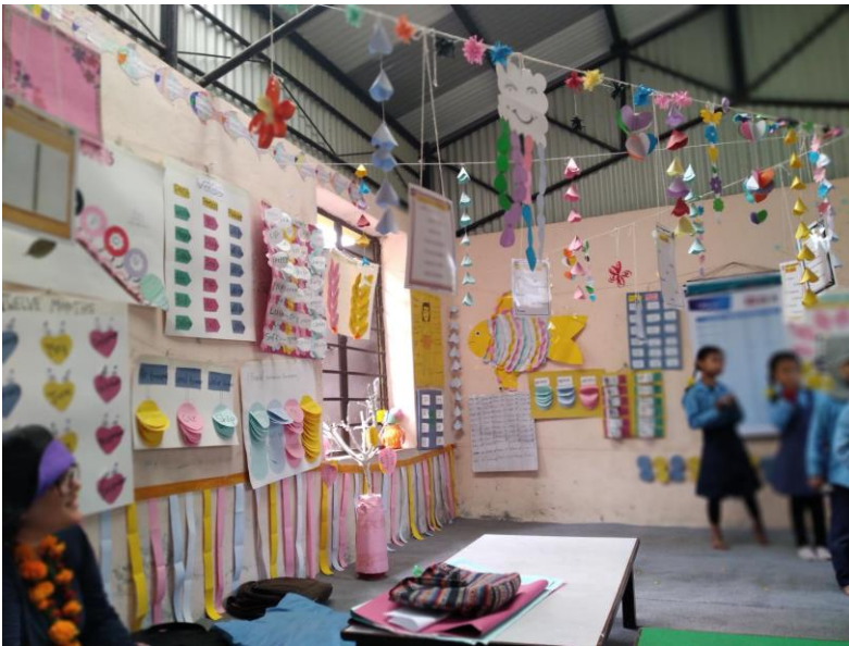
Child-friendly classroom in Tawal Besi primary school