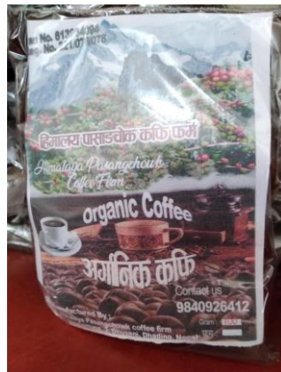
Balsing's roasted coffee