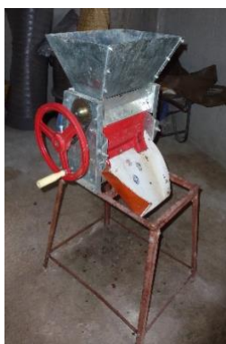
Coffee huller and 'simple' greenhouses funded by Nepal government grants