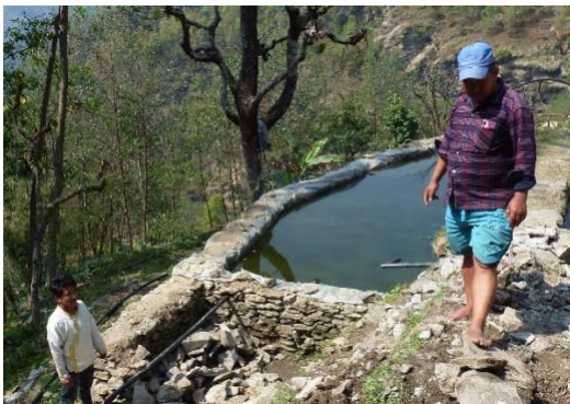
Fish farming initiative for "next generation" Cooperative member