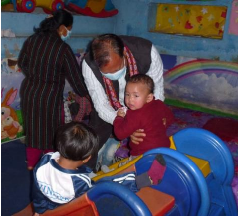
Thimi childcare creche for carpet factory and other poor families

NAFA supports two childcare centres: a childcare crèche for carpet factory families in Thimi and a childcare centre for poor families operated by the Butterfly Foundation in Pokhara.