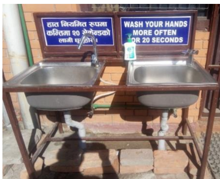
Wash basins at VSN school in Thimi

NAFA allocated nearly $8,000 for COVID-19 support in 2021, bringing our total COVID-related allocations to over $21,000. We provided additional personal protective equipment and supplies to 5 NAFA-funded partners, a school and the local community in Thimi and people with a disability in Pokhara. NAFA also partnered with Joy Foundation Nepal to support front-line health workers in Nepal.