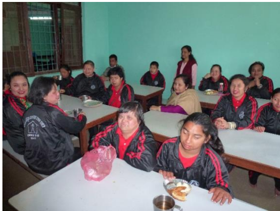
Young women having lunch at Sungava Home