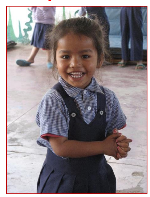
Visit nafa.org.au/donations to donate now.