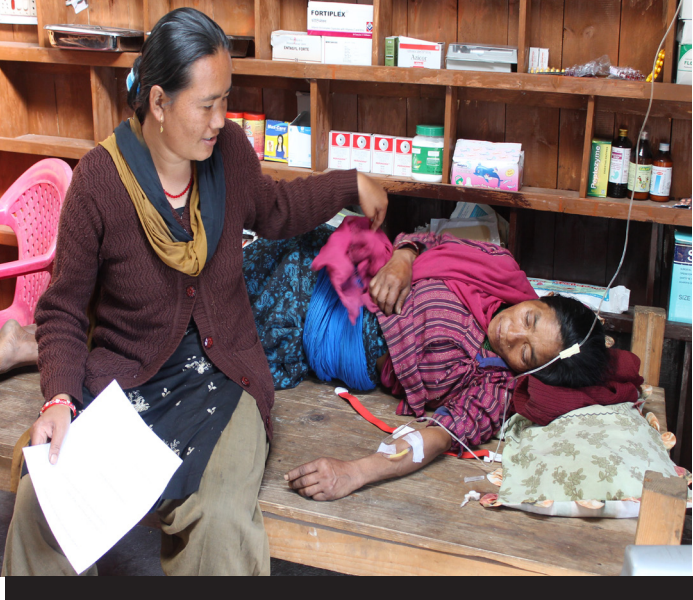
Tawal Health Clinic