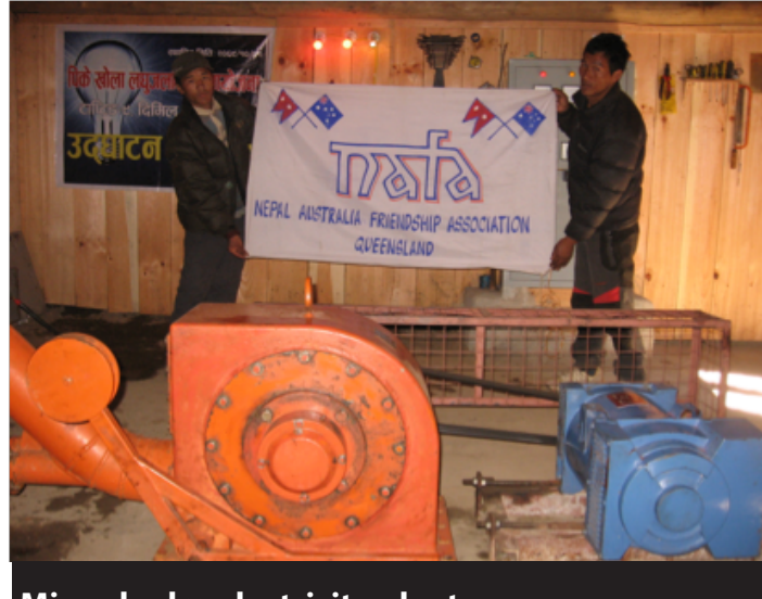
Micro-hydro electricity plant