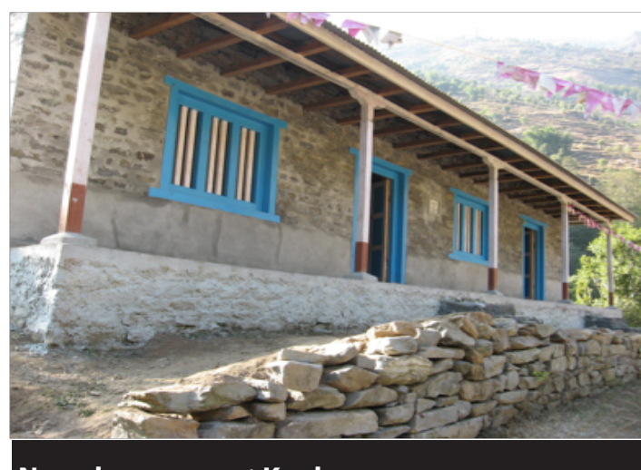
New classrooms at Kophu