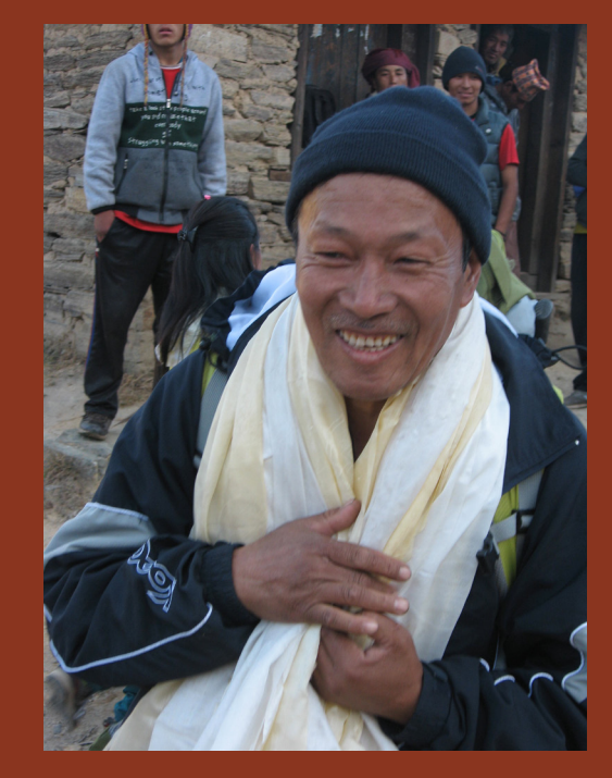
dhanyabaad (thank you)

All people in Mulkharka, Kophu, Narjing, Lumsa, Gernapur, Dimil, Patle, Shyama, Dhupisurke and Chhermading village say thank you to NAFA for all your help and cooperation.